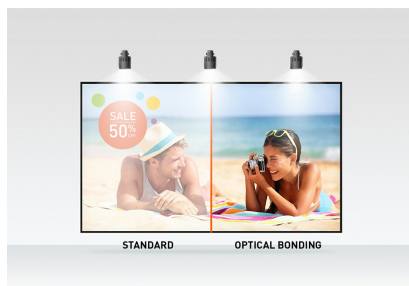
Optical bonded PCAP

The ProLite T2755MSC with its Full HD (1920x1080) resolution and with IPS panel technology offers exceptional colors and wide viewing angles. The Optical Bonded Projective Capacitive (PCAP) 10-point touch technology ensures a seamless and accurate touch response and a lower light reflection, in addition, the display is protected against humidity and potential moisture development. A special Nano coating ensures a smoother touch and less resistance in the swipe. It makes the screen less static and susceptible to dirt, dust and fingerprints. Its flexible stand can be positioned at several angles creating a comfortable and ergonomic user experience. A perfect choice for a vast array of applications.